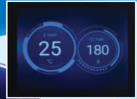
Client Viewing Screen