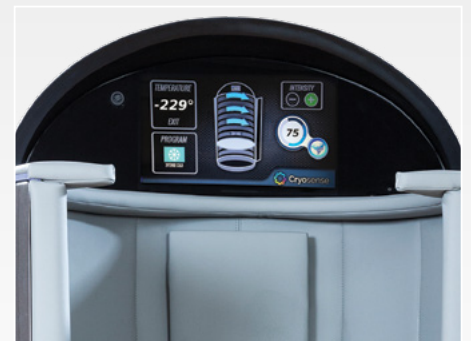
Cabin viewing screen

Please call Sales at 214.363.3111 for all pricing information.