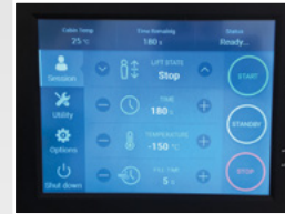
Operator Viewing Screen