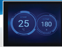
Client Viewing Screen

Please call Sales at 214.363.3111 for all pricing information.